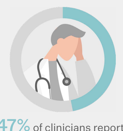
47% of clinicians report feeling symptoms of burnout<sup>1</sup>