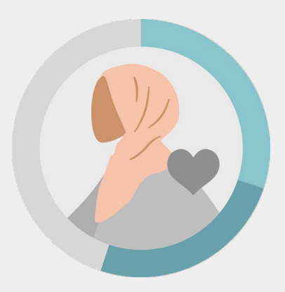
30–55% of a person's health outcomes are determined by social determinants of health<sup>5</sup>