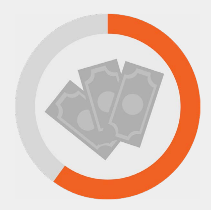
60% of healthcare spend is focused on inpatient & outpatient care<sup>4</sup>